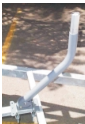
Campersat Traveller Mounting Bracket

The Australian Free to Air Satellite broadcast is available in superb digital quality right across Australia. Travellers should be aware of reduced signal in the far north and south west and under heavy rain or dense overcast conditions. Picture quality will remain picture perfect until there is insufficient signal to operate the receiver.