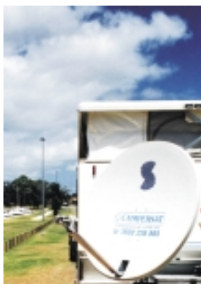
Campersat Traveller front view